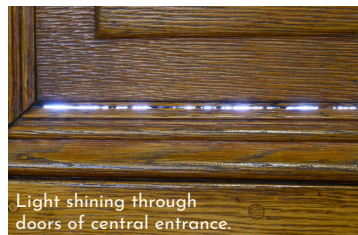
Light shining through doors of central entrance.

Additional phases are still seeking funding arms, but are planned to address similar issues in other areas of the exterior.